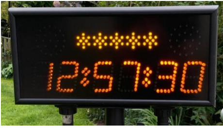
Red goes out with 5s left