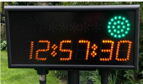
The green light comes on when time to go (12:57:30).

Timing will start at the point the green light is shown, irrespective of if the navigator has actually finished with the paperwork!