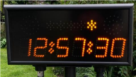
last 5s counted on the amber leds