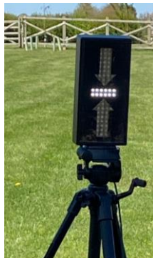
Just right. Stop